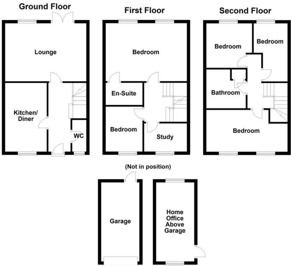
Not to scale. For illustrative purposes only

COUNCIL TAX West Northamptonshire Council - Band E